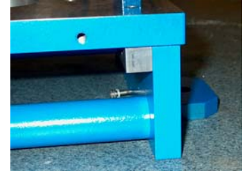
view from back Photo 1.2